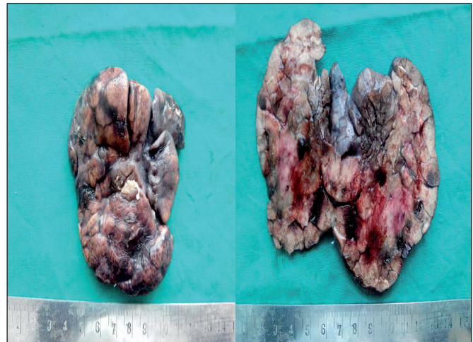
Figure 2: Lobectomy specimen measuring 8.5x6.5x2.0 cm appears overinflated. External surface of the lung showed hazy pleura, brownish grey at places. The cut section was grayish white, with occasional brownish lobules separated by fibrous septae, soft to firm in consistency.

Respiratory distress and dyspnea are the major complaints followed by recurrent respiratory tract infections and cyanosis. A review of the literature showed that the left upper lobe is usually the most frequently affected lobe followed by the middle and right upper lobe, the lower lobes being rarely affected. Okazaki and Kumart reported bilateral involvement of the lung in CLE in their studies (6,7). Definite etiological factors could not be identified in half of the cases. Again in half of the cases, there is partial bronchial obstruction due to absent, hypoplastic or immature bronchial cartilage producing ball valve effect with consequent overinflation, endobronchial obstruction by exuberant mucosal fold, extrinsic compression by aberrant bronchi or vascular structures bronchogenic cyst and rarely congenital CMV infection (8). Recently theory of polyalveolosis has been described as a cause of CLE (9). In