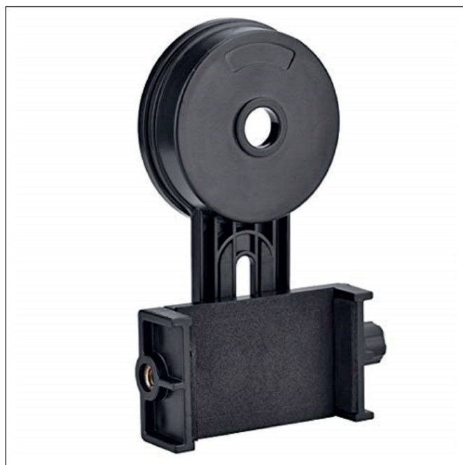
Figure 1: An example of a microscope adapter for smartphone used in our study.

The main thrust of the group was on sharing images of difficult cases to create discussion on the differential diagnosis and diagnostic pitfalls.