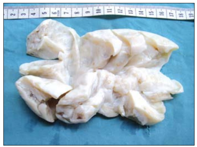
Figure 1: The section surface was generally solid with scattered areas filled with lipid macroscopically, making up a lesion with the consistency of a fish.

Massive ovarian edema is a rare event that is characterized by marked enlargement of the ovary following the development of edema in the stroma. It is usually seen in young females but a 6-year-old girl and postmenopausal women have also been reported (4).