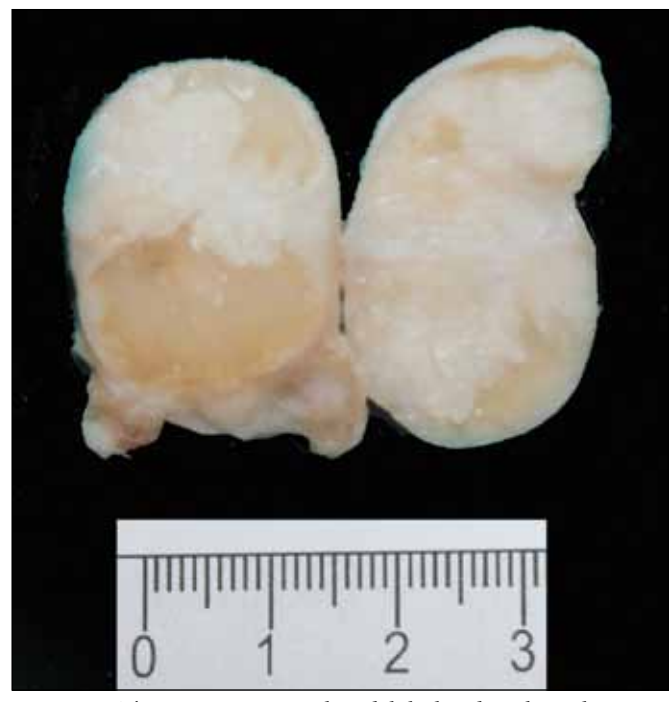
Figure 2: The tumor was oval and lobulated with a glistening white-yellow cut surface.