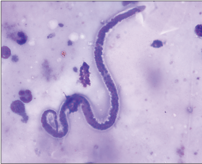
Figure 1: MGG-stained smear showing presence of microfilaria in a background of dispersed population of atypical lymphoid cells.

Histopathological and immunohistochemical confirmation of Non-Hodgkin's B cell lymphoma was done as advised on cytology. Although no microfilaria was seen in the paraffin-embedded sections, the sections from both the lymph node and adrenal biopsy showed tumor composed of sheets of atypical lymphoid cells displaying round to oval nuclei, dispersed chromatin, inconspicuous nucleoli and scant cytoplasm (Figure 2). Mitotic activity was occasional. On immunohistochemistry, the tumor cells were positive for Leucocyte common antigen (CD45) (Figure 3) and CD20 and were negative for pancytokeratin and CD3.