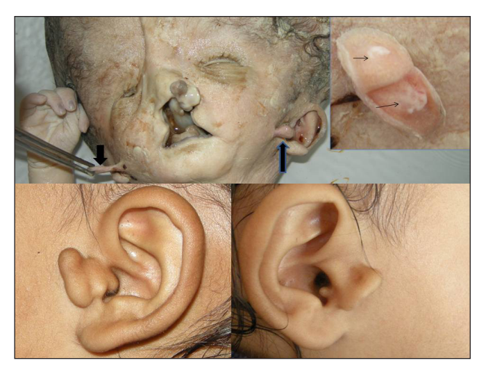
Figure 2: Fetus: Bilateral preauricular accessory pinnas (up and down block arrows). Inset: Cut section of accessory pinna showing whitish cartilaginous body (right line arrows). Lower right and left accessory pinna of case 5.