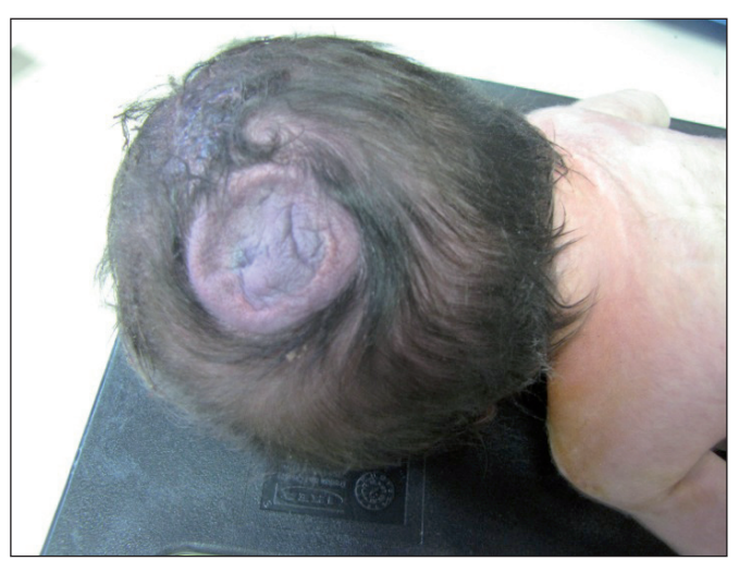
Figure 1 : The external appearance of occipital encephalocele.