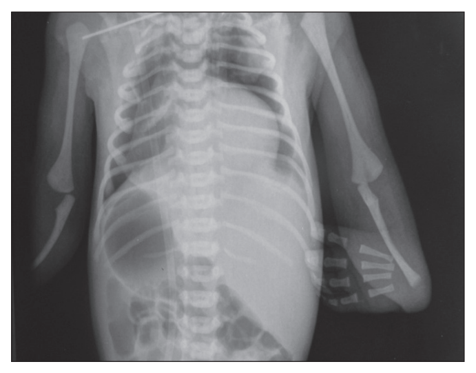
Figure 2: X-ray image of bilateral radial agenesis.