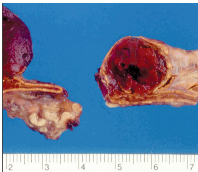
Figure 1: Bilateral pheochromocytoma noted in multiple endocrine neoplasia 2 (MEN 2) syndrome.

Classical lesions associated with paragangliomas or pheochromocytomas occur in the hereditary syndromes - neurofibromatosis, multiple neuroendocrine neoplasia (MEN) (II and III) syndromes and von Hippel-Lindau syndrome (44). They are autosomal dominantly inherited diseases. In the settings of neurofibromatosis type I ( NF1 gene), pheochromocytoma or paraganglioma could be associated with other neurofibromas, malignant peripheral nerve sheath tumours and gliomas as well as café au lait spots, iris hamartoma and dysplasia of the sphenoid bone. Less commonly, gastrointestinal tumours, glioma or leukaemia may be noted. In multiple neuroendocrine neoplasia II ( RET gene), pheochromocytoma could be found with medullary thyroid carcinoma and parathyroid hyperplasia. In multiple neuroendocrine neoplasia III ( RET gene), pheochromocytoma could be seen in the settings of medullary thyroid carcinoma, marfanoid habitus