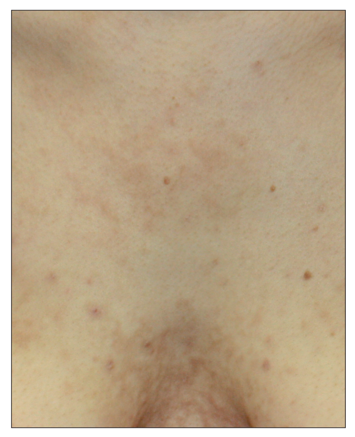
Figure 4: On the 10<sup>th</sup> day of Doxycycline 100 mg/g treatment, papules and plaques resolved to leave light hyperpigmentation.

documented 300 cases of prurigo pigmentosa (2). While it is rarely seen outside Japan, cases have been reported in other countries with increasing frequency (3,4). Baykal et al. published a series of case studies of 6 patients in 2006