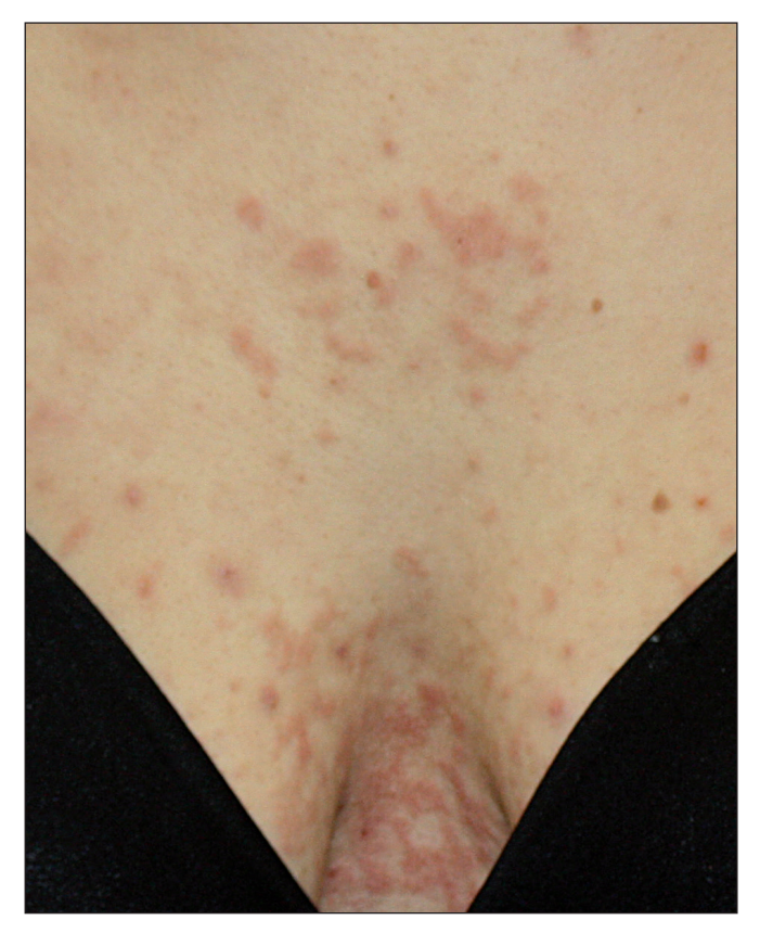
Figure 1: Edematous, papules and plaques, some of which are excoriated, coalescing on the neck laterals, intermammarian area, and anterior chest.