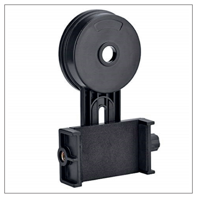
Figure 1: An example of a microscope adapter for smartphone used in our study.

The main thrust of the group was on sharing images of difficult cases to create discussion on the differential diagnosis and diagnostic pitfalls.