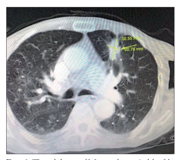
Figure 1: CT revealed a mass of 3x2 cm on the superior lobe of the left lung (yellow arrow).

Acantholytic SCC comprises 2-4% of all cutaneous SCCs. Many skin pathology textbooks histologically characterize SCC as adenoid (pseudoglandular) or pseudoacinar nests with central acantholysis and cohesive peripheral tumor cells. The skin is the most frequent site of acantholytic tumors, with common skin pathology references. Pulmonary acantholytic SCC results in an aggressive clinical course, with marked lymphatic metastases (4,5). p40 has high immunohistochemical sensitivity and specificity to distinguish lung adenocarcinoma and SCC and appears to be an excellent marker for SCC. p40 immunostaining should be performed routinely for the diagnosis of pulmonary SCC (6). The positive expression rates of TTF-1 and NapsinA are higher in lung adenocarcinoma, and TTF-1 is highly specific and sensitive in the diagnosis of adenocarcinoma. NapsinA may be used to distinguish ADC and SCC (7).