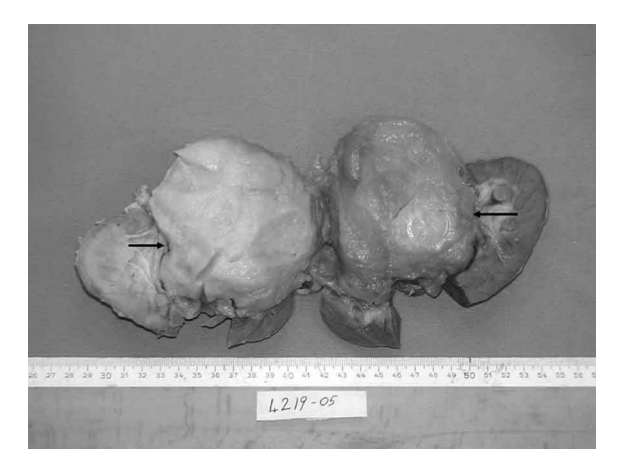
Figure 2. The middle pole of the left kidney contains a well-demarcated, yellowish, and gelatinous tumor compressing the surrounding renal parenchyma (arrows).