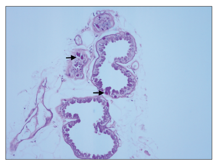
Figure 2: PAS positive inclusion bodies (arrows) in apocrine glands (PAS; x200).

The authors declare no conflict of interest.