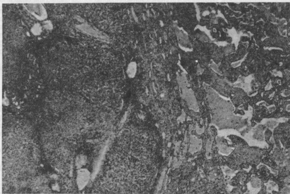
FIGURE 3: The adjacent liver tissue showing nodularity and features of 'surgical hepatitis' (HE, x 32).

Because hepatic hemangiomas are usually small, averaging from 1 cm. to 2 cm. in diameter and also remain silent, most are discovered incidentally at laparotomy and autop-