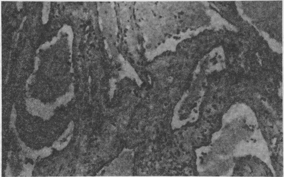
FIGURE 2: Microscopic appearance of cavernous hemangioma of the liver: markedly dilated, irregularly outlined, mostly blood-filled channels lined by flattened endothelial cells and fibrous connective tissue septa dividing the channels (HE, x 310).