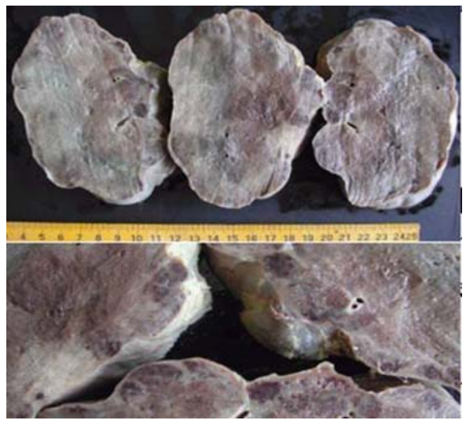
Figure 1. Gross appearance of tumor on cut section. Multiple dark-red, spongy nodules in the parenchyma.

Microscopic examination showed an angiomatous lesion involving the entire spleen. Remnants of the red pulp were observed among the pathological vessels throughout the spleen (Figure 2a). The pathological vessels were mostly thin walled, cavernous vessels were lined by a flat to cuboidal endothelium without any cytologic atypia or mitosis (Figure 2b). The lumina contained weakly stained serum and erythrocytes. In some areas, red pulp persisted but sinuses were stretched. There was increased fibrosis in the residual red pulp. In some areas, there seemed to be a gradual transition from cystically dilated splenic